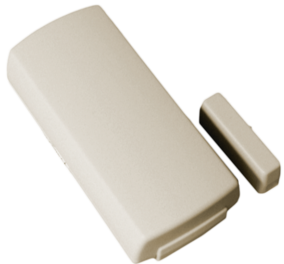
Part No. PAL-102410